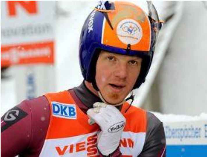
Mārtiņš Rubenis, Olympic luger from Latvia

Source: Mārtiņš Rubenis, retired luger, Latvia 261