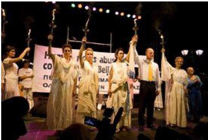
Mārtiņš Rubenis at the lighting ceremony for the Human Rights Torch Relay to raise awareness of forced organ harvesting in China ahead of the 2008 Beijing Olympics (August 9, 2007 at Syntagma Square in Athens, Greece).

After Latvian luger Mārtiņš Rubenis won a silver medal at the World Luge Championships in 2003, he won a bronze medal at the 2006 Winter Olympics in Torino. This was Latvia's first Olympic medal after it gained independence from the Soviet Union. Rubenis thus became a household name in the country.