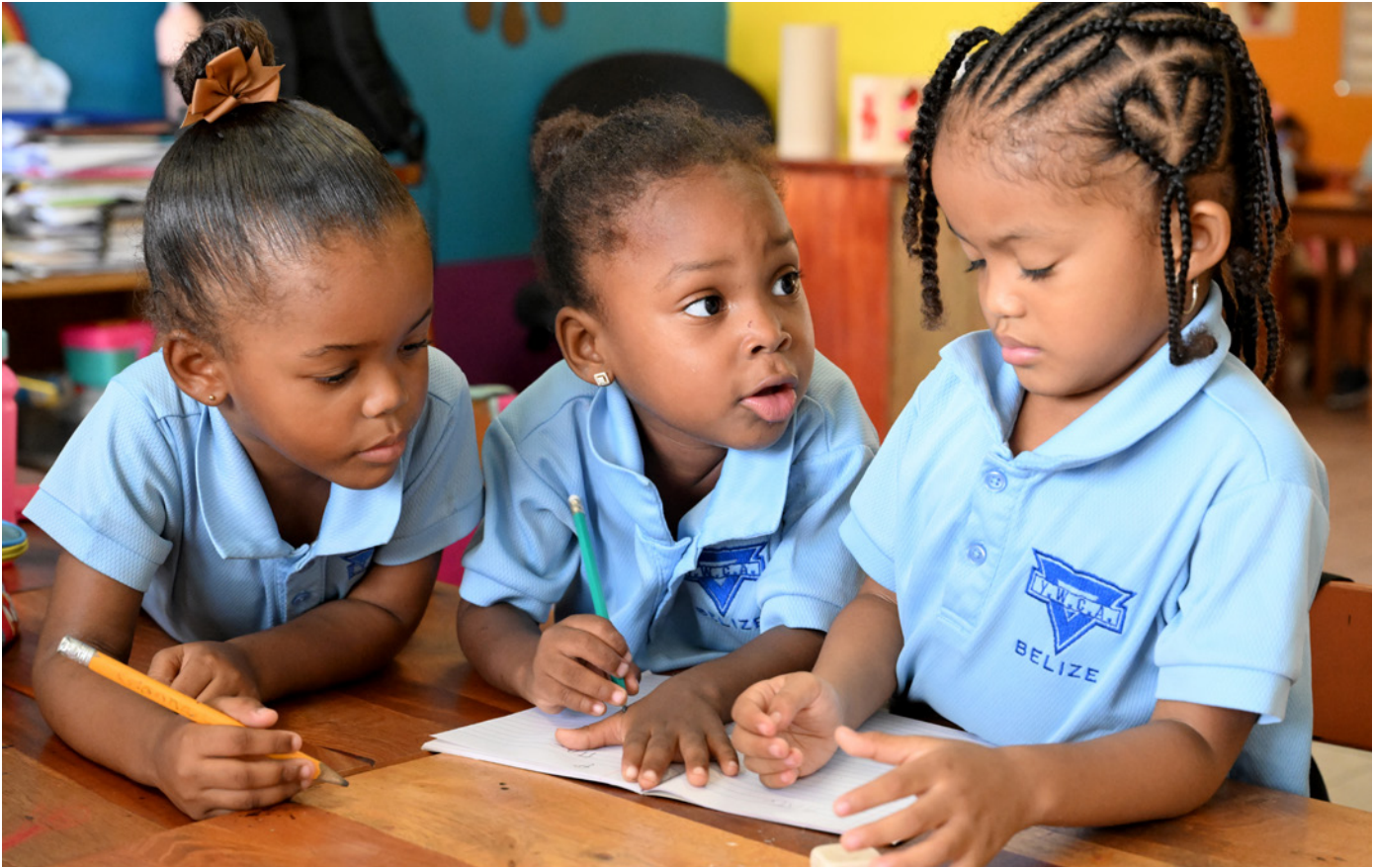
Belize, 2024

Long-standing learnings from existing national development policies and solid rigorous evidence developed across regions and contexts have given us a clear indication of what works for children. The challenge is how to best support policymakers in how they prioritize these policies and commit to their realization, while addressing challenges that impede investments at scale. In this process, identifying interventions and policies impacting multiple child outcomes can be a game changer for accelerating progress ■